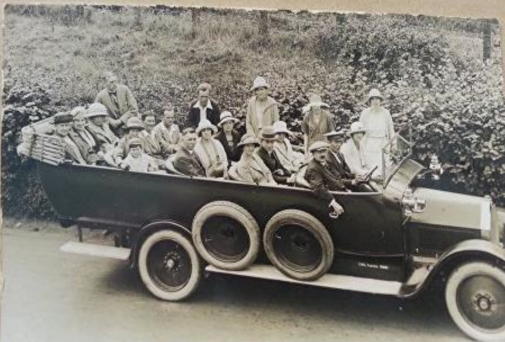
THE LOVELY CARS